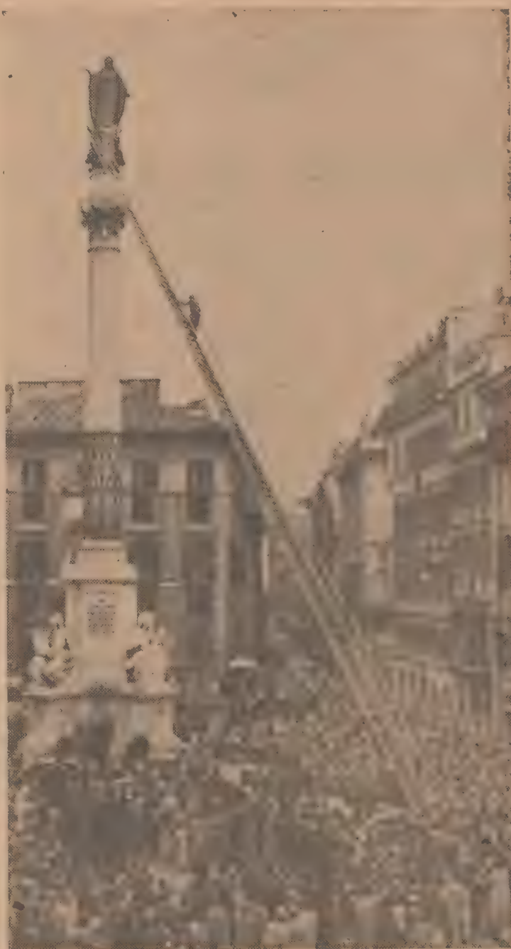
FLOWERS FOR THE MADONNA —Each year, thousands of the faithful crowd around the giant column in Rome's Piazza di Spagna to lay flowers at the foot of the column which supports a statue of the Madonna. A highlight of the ceremony is the placing of a bouquet at the feet of the statue. A fire truck is pressed into service and a fireman climbs high on a ladder to complete the ceremony under the watchful eyes of the vast crowd.

Upon his arrival in New York, the Premier, Mr. Churchill, in an interview with the press stated that Allied action in Korea has given the world a hopeful future for